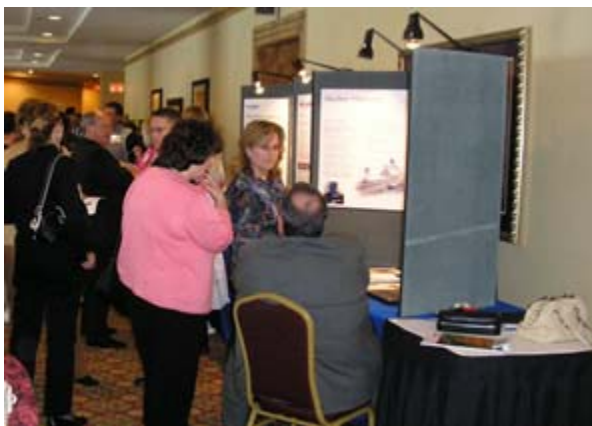
Fall meeting attendees enjoy a refreshment break while visiting with exhibitors.

The 2005 program on image fusing included the following topics and speakers.