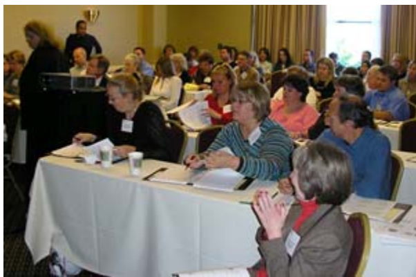
A full house listens to the technology track at the 2005 Fall meeting.